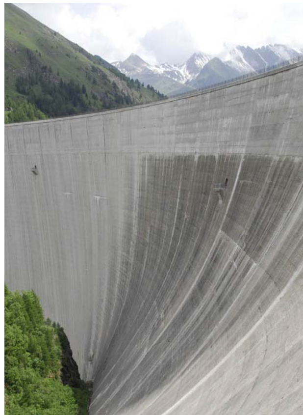
Figure 7 - Luzzone Dam. The IPU uses electricity from all renewable sources

We continue to seek efficiencies to reduce administration costs. In 2010 there will be another quantum reduction in costs when the office furniture purchased for the headquarters is fully amortized. However, due to the large proportion of fixed costs in the cost centre, such as depreciation and insurance, the biggest cost efficiencies in the future will come from economies of scale as the Union expands.