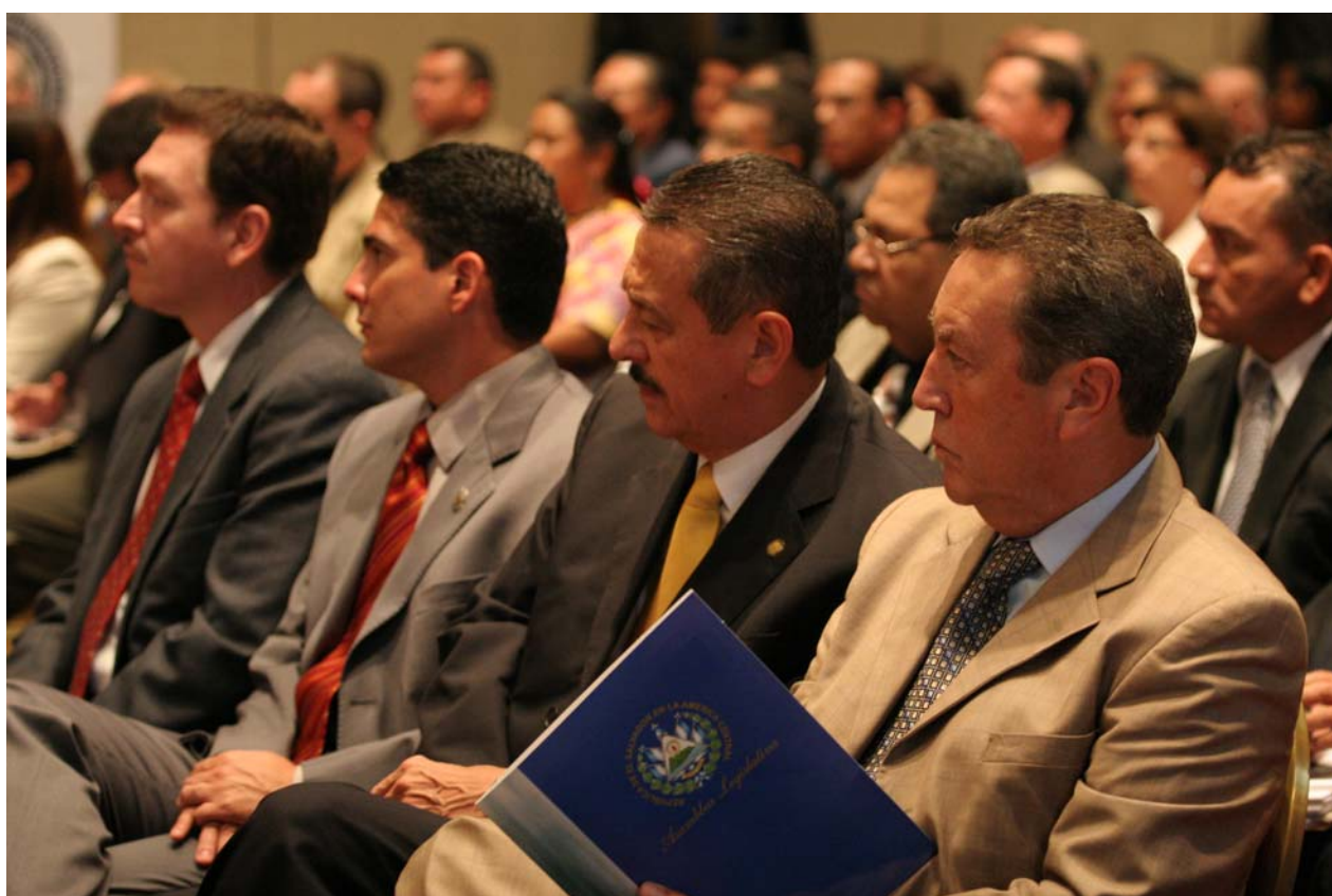
Figure 2 - Delegates to the seminar on reconciliation, El Salvador