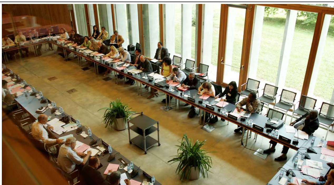
Figure 8 - The IPU aims to occupy the conference facility at least 50 per cent of the time.

Starting in 2008, the Division tracks the indirect greenhouse gas emissions that result from international staff travel and reports these annually to the Governing Council.