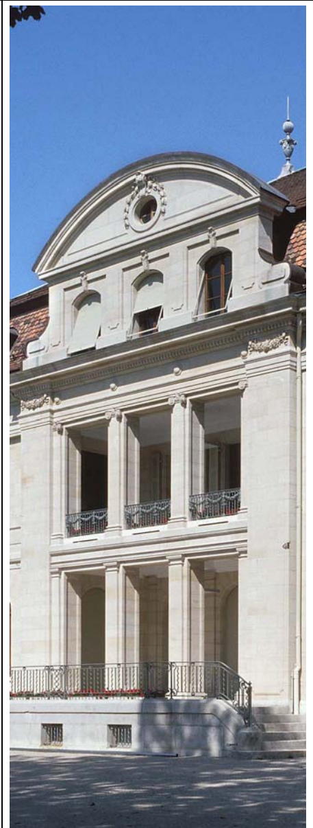
Figure 9 - A reserve is established for repairs to the House of Parliaments when they are needed.

The Inter-Parliamentary Union makes an annual grant to the Association of Secretaries General of Parliaments in an amount which is determined on an ad hoc basis each year at a level which is sufficient to meet the expenses of the organization that are not funded from other sources. A longer term relationship agreement is needed.