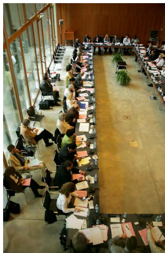
Figure 5 - A Steering Committee meets twice a year to prepare for the annual Parliamentary Conference on the WTO.

In terms of public information and outreach, the IPU will implement the recommendations set forward by the 2005 Saatchi & Saatchi Report on IPU's information and communication strategy. The Information Service will be reorganized and strengthened to increase the visibility of the IPU and, in particular, make better use of modern communications tools.