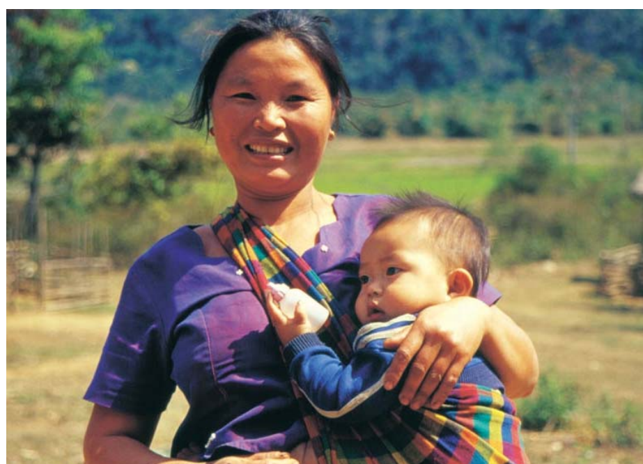
Figure 4 - Maternal and Child Health is a new focus for the IPU

Activities will impact on the natural environment. To reduce the deleterious effects, efforts will be made to publish information in electronic format and make use of virtual contacts in order to reduce the need for travel.