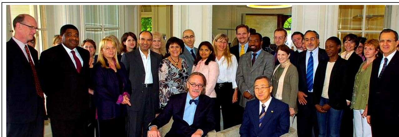
Figure 10 - The Secretariat on the occasion of the visit of the UN Secretary-General

Benefits such as pensions, dependency allowances and child education allowances are provided to staff in accordance with the UN common system. Some other benefits, such as health and accident insurance, are defined internally by the Union. The budget for staff benefits and overheads from regular sources is increasing by 2.2 per cent over 2008 to CHF 1,998,000 driven by health insurance and pension costs. In addition, the staff benefits charged to project budgets will be CHF 330,300.