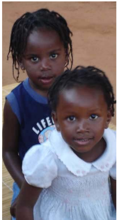
Figure 3 - Sisters in Maputo: Children have human rights.

The IPU will establish a small, geographically representative parliamentary Advisory Group to identify priority issues of concern, raise awareness, foster debate on child protection topics at the statutory Assemblies and during specialized meetings of the IPU, and make recommendations for action by the IPU and its members.