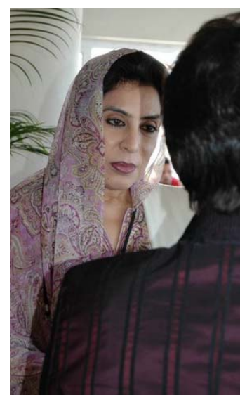
Figure 6 - IPU meetings, like this meeting of Women Speakers, are an opportunity for open dialogue between parliamentarians