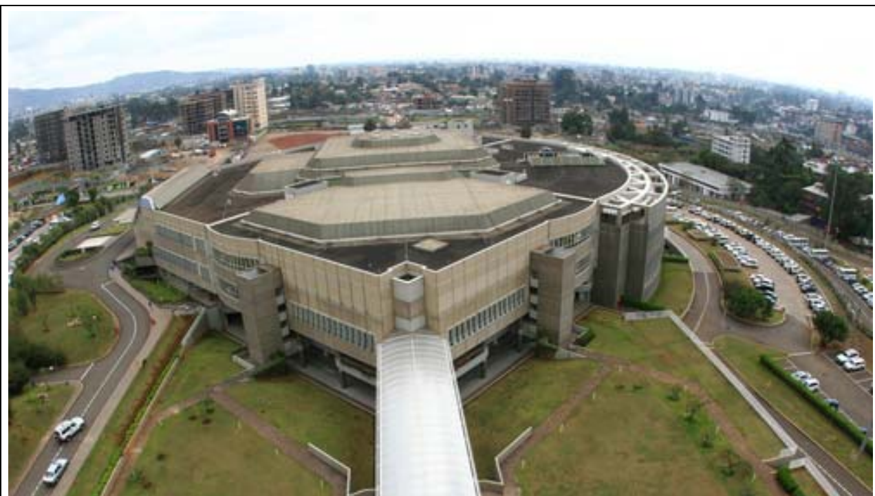
Figure 1 - ECA Conference Centre in Addis Ababa

Three bodies – the Meeting of Women Parliamentarians, the Coordinating Committee of Women Parliamentarians and the Gender Partnership Group -- ensure that women delegates are engaged and that gender issues and perspectives feature prominently at the Assembly. Members want to see women making up 30 per cent of delegates.