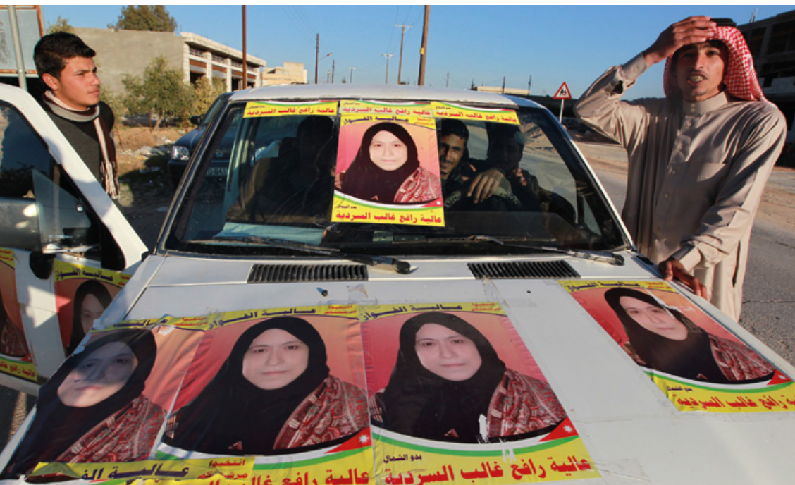
Supporters of a woman candidate post her pictures on their car in Al Mafraq City near Amman, 19 January 2013.

roughly doubled their presence in the lower house (to 18.6%) and reached 26.5 per cent in the upper. Among the year's historic milestones was the election of Peris Pesi Tobiko, the first Maasai woman to enter parliament, and of five women senators (out of the current 18) between the ages of 24 and 33. No women were elected at all, on the other hand, to more than half of the country's subnational assemblies despite a constitutional provision prohibiting more than two-thirds membership for either sex.