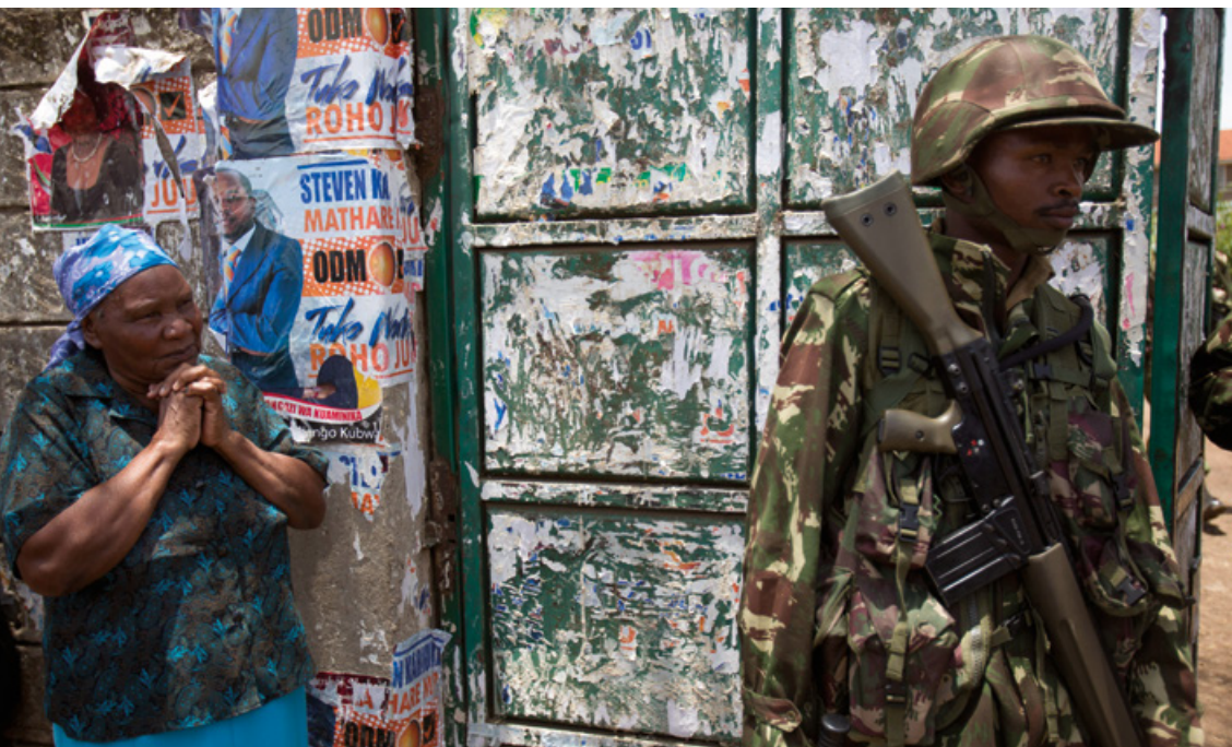
A woman waits outside a tallying centre with a Kenyan police officer guarding the gate at Mathare slum in Nairobi, 6 March 2013.

crowdsourcing experience) to provide women with a stronger platform for identifying and mitigating incidents of violence, such as those witnessed in Haiti after the 2010 earthquake. These tools are being incorporated into efforts to monitor election violence targeting women, a phenomenon frequently invisible to the public as a result of unreported incidents. The crowdsourcing-mapping tool used by Ushahidi to map election-related violence in 2007/2008 in Kenya has been applied for the purposes of early warning in other parts of Africa. In Mali, for example, UN Women has supported its application as part of a "Situation Room" model, also used previously to support women candidates in Senegal and Sierra Leone. The initiative relied upon incident reports collected through text messages and cell phones as well as other ICT tools to provide rapid response to victims. 3