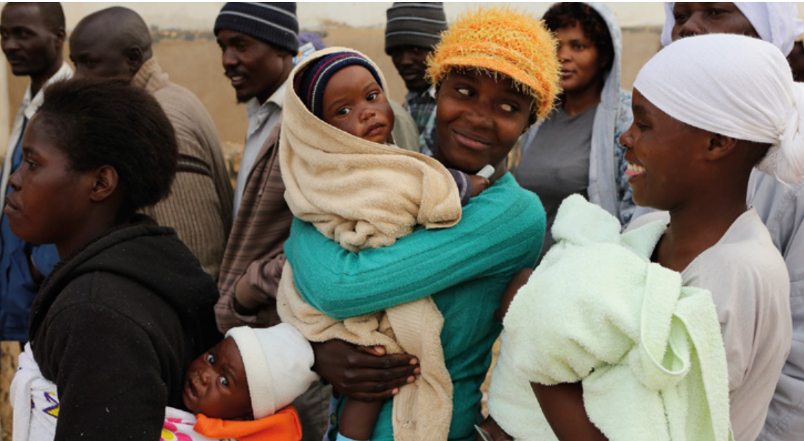
Zimbabwean women wait to cast their votes at a polling station in Domboshava, 31 July 2013.

2013 breaks all the records for women's participation in parliaments worldwide. The percentage of parliamentary seats occupied by women rose to 21.8 per cent, an increase of 1.5 percentage points – double the average rate of increase in recent years.