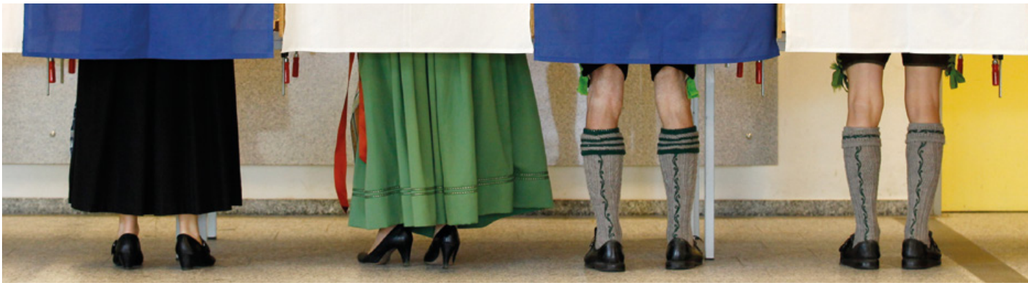
Voters wearing traditional Bavarian dress cast their ballots in German general election at a polling station in Gaissach, 22 September 2013.

representation systems, open or closed candidate lists have an important effect on women's electability. Where candidate quotas exist, closed lists tend to favour women's access to parliament. However, in the absence of quotas, open lists afford women greater opportunity to compete because they allow voters a certain flexibility in selecting candidates. Majoritarian electoral systems limit women because, amongst other reasons, they provide fewer opportunities for representation.